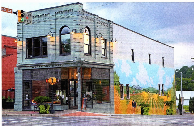
▲ Downtown Elkin offers live music, shopping and dining including Southern on Main, left, which opened in 2016.

letters, a comforting glow on cold winter nights.