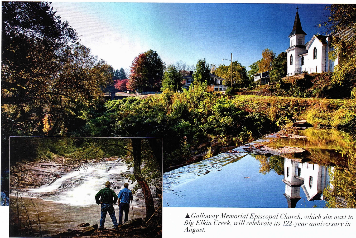
▲ Galloway: Memorial Episcopal Church, which sits next to Big Elkin Creek, will celebrate its 122-year anniversary in August.